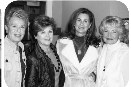
WWC models wait to walk the runway