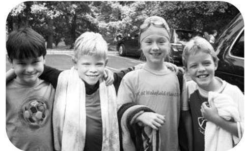
Above: some of our Wakefield Tsunami swim team participants at their away swim meet against Hawthorne. (Wakefield Won!)

Keep your eyes peeled and thank you for your assistance in keeping Wakefield Plantation a safe place to live!