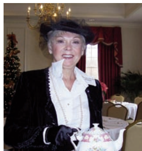
Dee for tea!