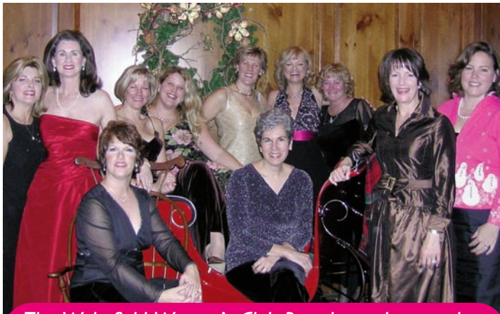
The Wakefield Women's Club Board members at the December 2nd Holiday Gala!

Wakefield Women's Club (WWC) is a great way to make friends, get to know your community and have fun.