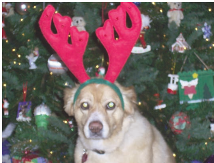
"Ella"-decked out for the hoidays!

Please send submissions (pictures in .jpg form, please) to