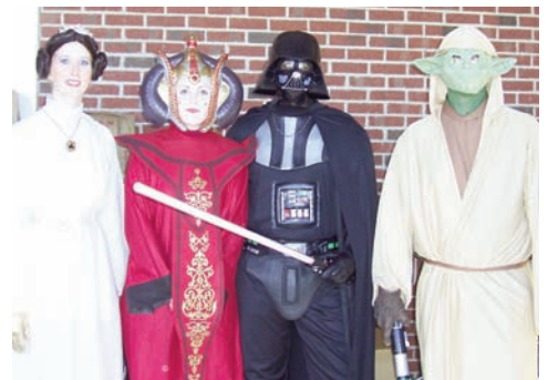
ABOVE: Food Lion manager and employees dress as characters from Star Wars and hand out goodies to excited kids! BELOW: The Jellybeans Skate Car leads the parade!